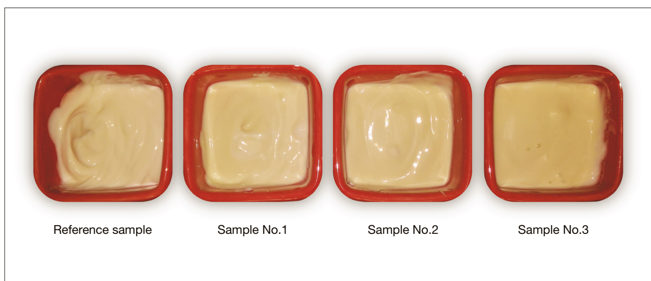
Figure 1. The appearance of mayonnaise sauces